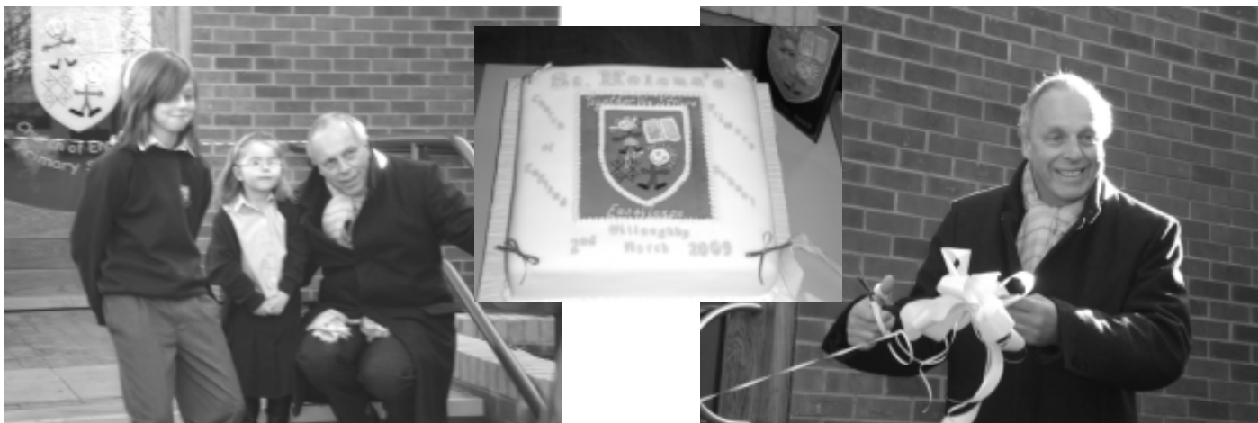
March 2nd 2009. St Helena`s School. The official opening by Simon Woodroffe and dedication of the school extension.