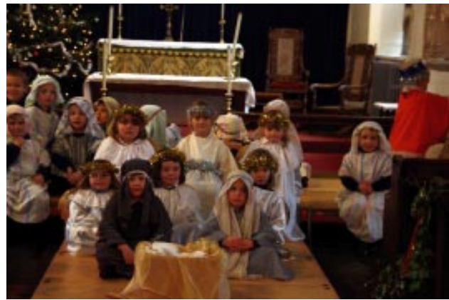
Schools tell the Christmas story with Stile