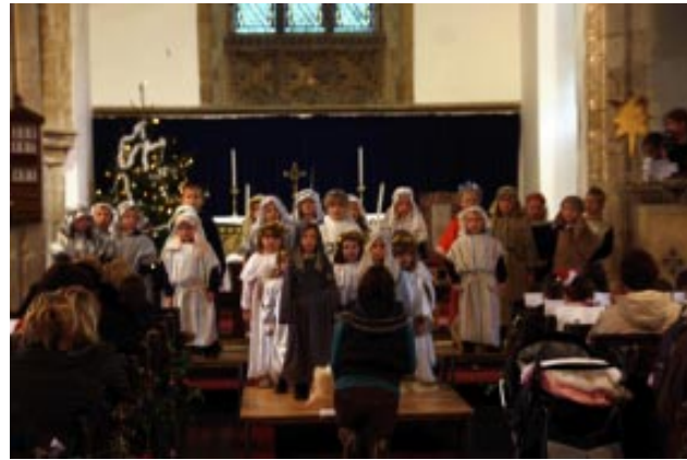
Willoughby School at Willoughby Church