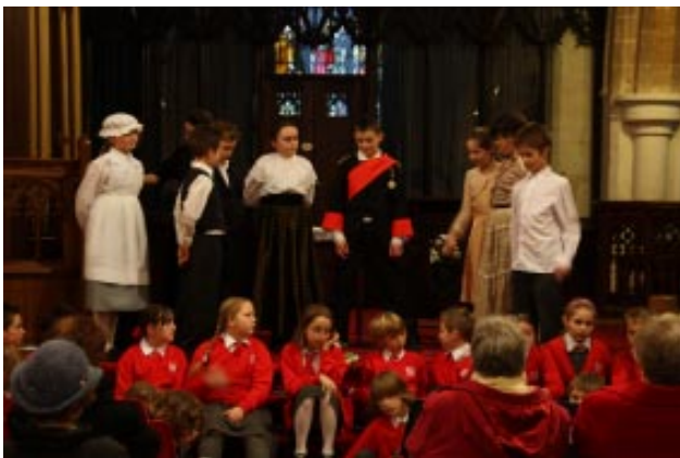
Huttoft School at Mumby Church