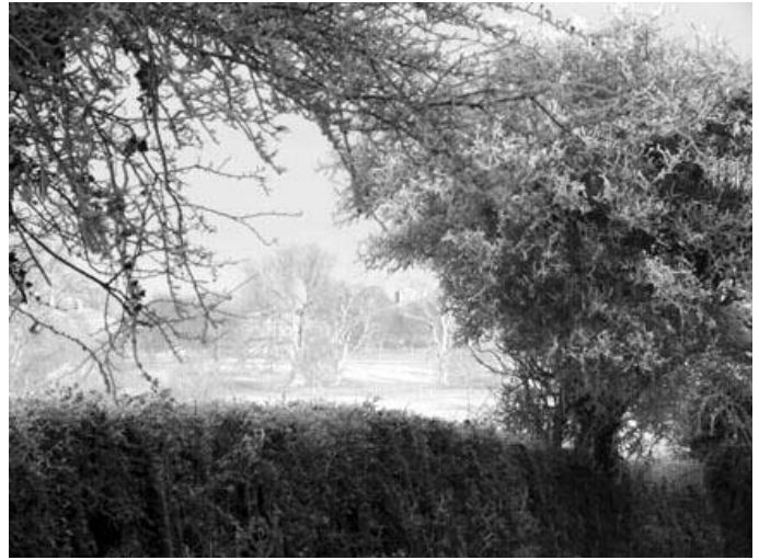
Frost at Ulceby