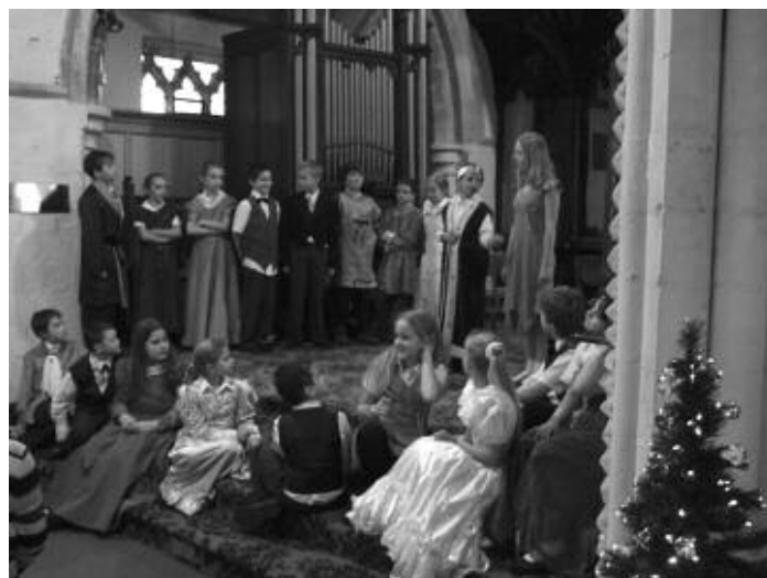
Huttoft School at Mumby

The School brought its Christmas Production " PAPAPANOV " to Mumby Church on Friday, 15 th December at 11.00am. This year the children, a cast of 46 pupils, were telling Tolstoy's story of Papa Panov, an old Russian Shoemaker, patiently waits for Jesus to visit his workshop on Christmas Day. Throughout the day, the weary and disadvantaged call at his door – all are welcomed by him. Finally, he realises that Jesus has visited him after all! The audience, of about 30, were enthralled by the enthusiastic cast!