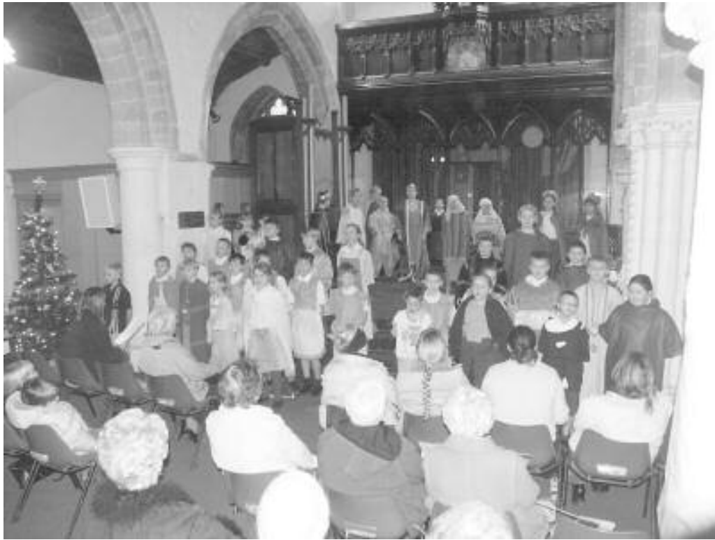
HUTTOFT SCHOOL CHRISTMAS PLAY : the senior children performed "THE LATE WISE MAN"