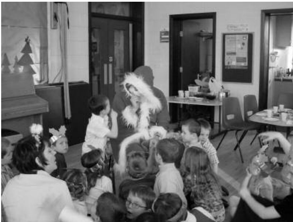
FATHER CHRISTMAS HAD TIME TO MAKE A SPECIAL VISIT TO THE CHILDREN OF ST HELENA'S SCHOOL