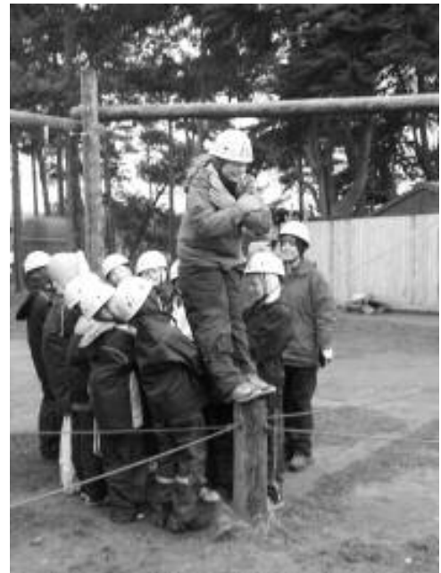
St Helena's School at Kingswood Activity Centre