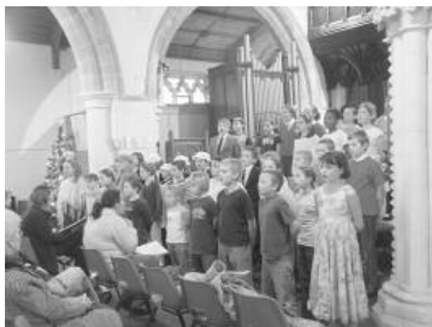
Huttoft Primary School performing 5 Gold Rings at Mumby

This year, they intend to bring their Summer Concert on Monday 18 th July and the Christmas Play on Friday, 16 th December, both at 10.30am. Make notes on your new calendars!