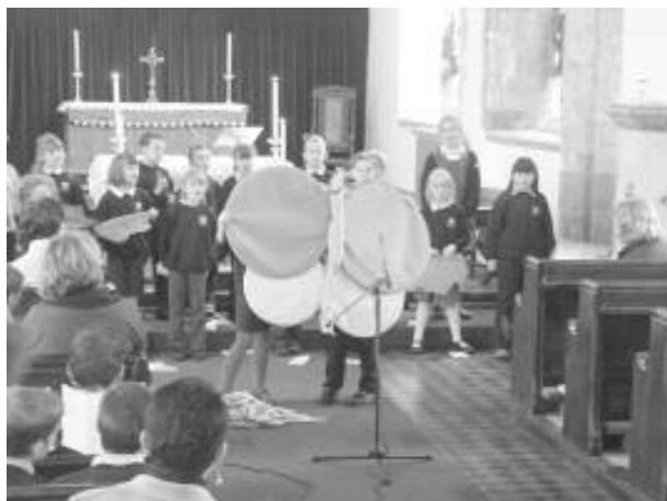
Studio 2 at end of term Service