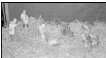
Crib at Willoughby. No wise men as they arrive at Epiphany (Jan 6th) and the shepherds depart.